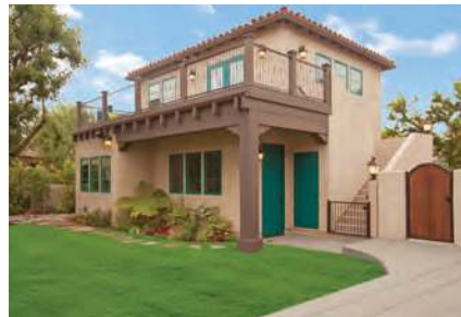
CLOCKWISE FROM FAR LEFT: The backyard view overlooking the infinity pool; a look into the back of the home, with barbecue installed by JDR and patio furniture from Restoration Hardware; from the backyard, an exterior view of the garage and guesthouse (second floor); bright colors carry into the guesthouse, too, with a rug from Amazon and curtains from Anthropologie.

Take the archway between the dining room and living room. It's obnoxiously thick, because the exterior wall of the home is sandwiched in between two new walls.