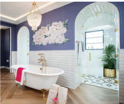
CLOCKWISE FROM RIGHT: The master bathroom includes a subway-tiled walk-through shower with four shower heads and a steam room conversion; outside the shower, there's an oversized Victoria + Albert clawfoot bathtub; Rhianna's office separates the master bath and bedroom, with a writing desk from Wayfair; a floral wallpaper from Spoonflower enlivens the master bedroom, with headboard from Anthropologie and rattan accent chair from World Market.