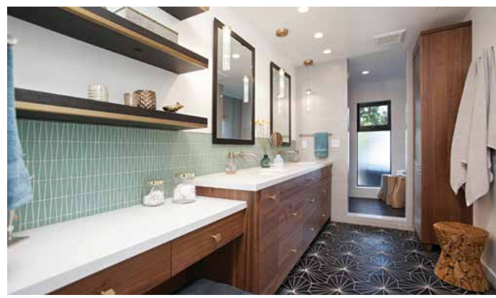
A bathroom designed by Rosella Gonzalez incorporates hexagon floor tiles, teal backsplash tiles and two different formats of white tile used as a calming backdrop.

includes the main floor's striking blackand-white geometric pattern," Rosella says. "The spa-like shower boldly balances four types of tile."