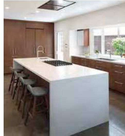
Christie May of Rockwell Interiors designed this sleek waterfall island with plenty of space for cooking and dining.

bathroom or closet, then doing one end is fine. Even then, you may still choose to do the stone on both ends, but you will only see the front-edge profile. I would look at the material quantity and overall budget costs.