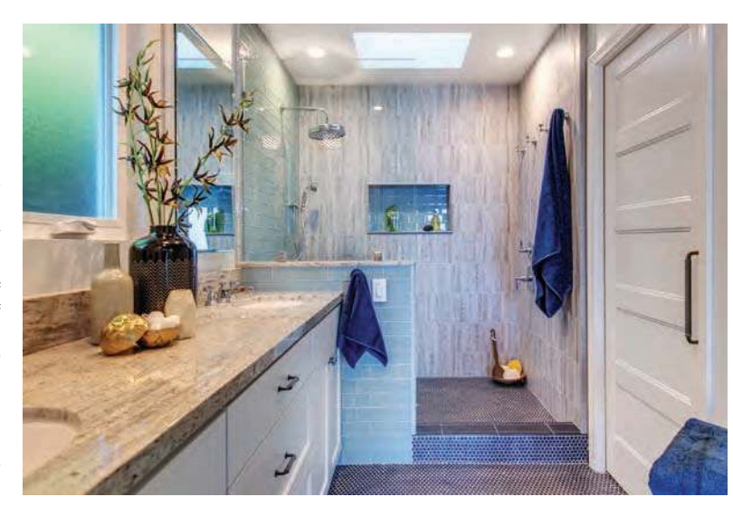
RIGHT: The master bath features sliding pocket doors and various tile patterns with shades of blue and gray, all designed to create a calming effect. "The pattern [in the shower] made me think of a deconstructed forest of birch trees," Ingrid explains. "I specifically asked for them to be stacked randomly." Ingrid is a studied gemologist, and the obsidian penny tiles and garnet crystals in the River White granite countertop are a nod to her love of jewel tones.