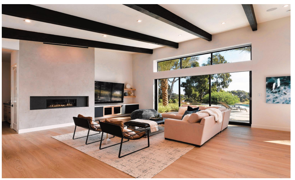
Porcelain tile is prized for its practicality and is scratch-resistant, stain-resistant and water-resistant. Unlike engineered wood, though, it is cold and hard on bare feet.

www.lajollalight.com PAGE B22 - JUNE 2, 2022 - LA JOLLA LIGHT