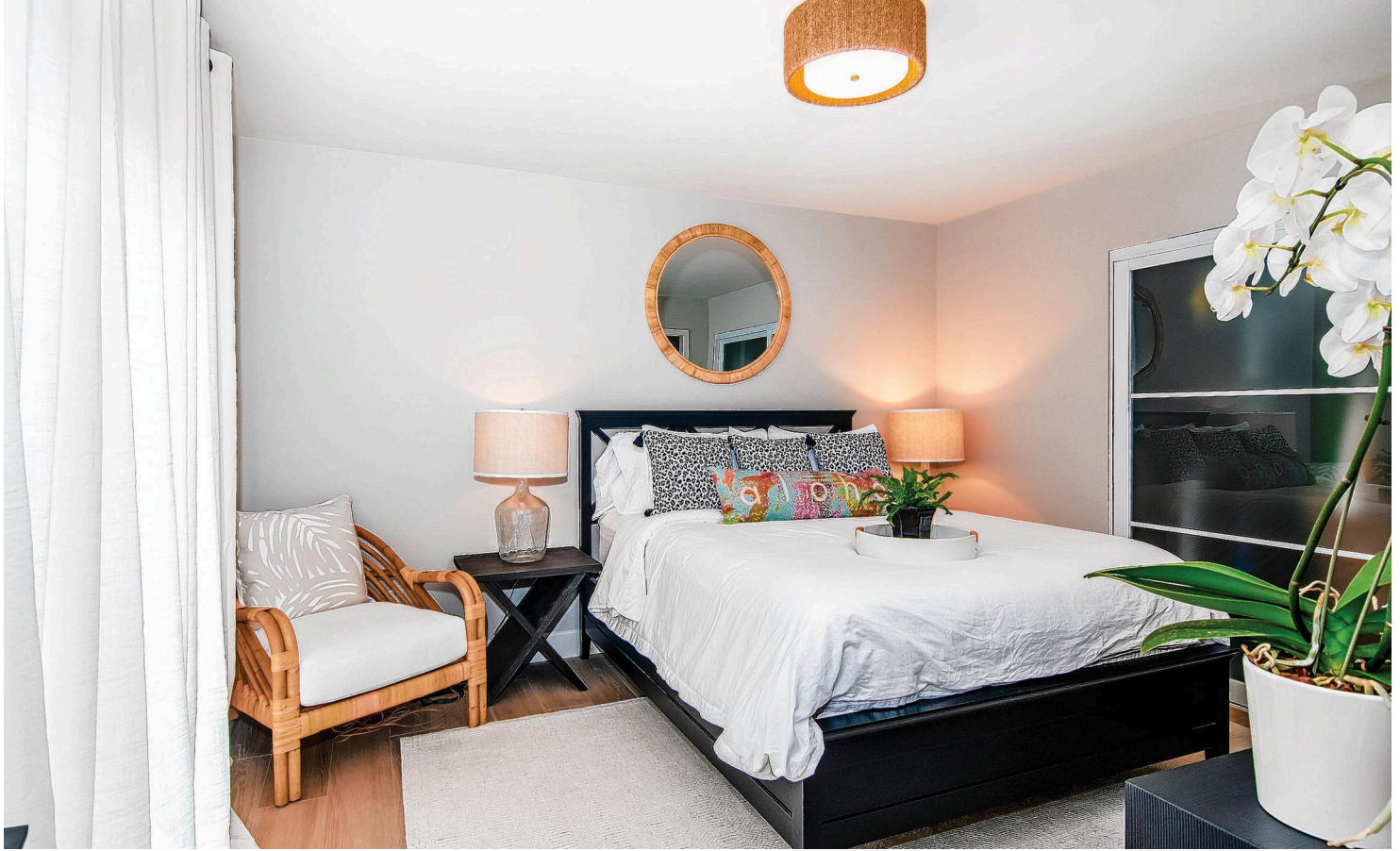
JACKSON DESIGN AND REMODELING

In the corner of the guest bedroom, a Serena & Lily bentwood Edgewater lounge chair provides a comfy spot to sit. The bed and side tables are from Pottery Barn.