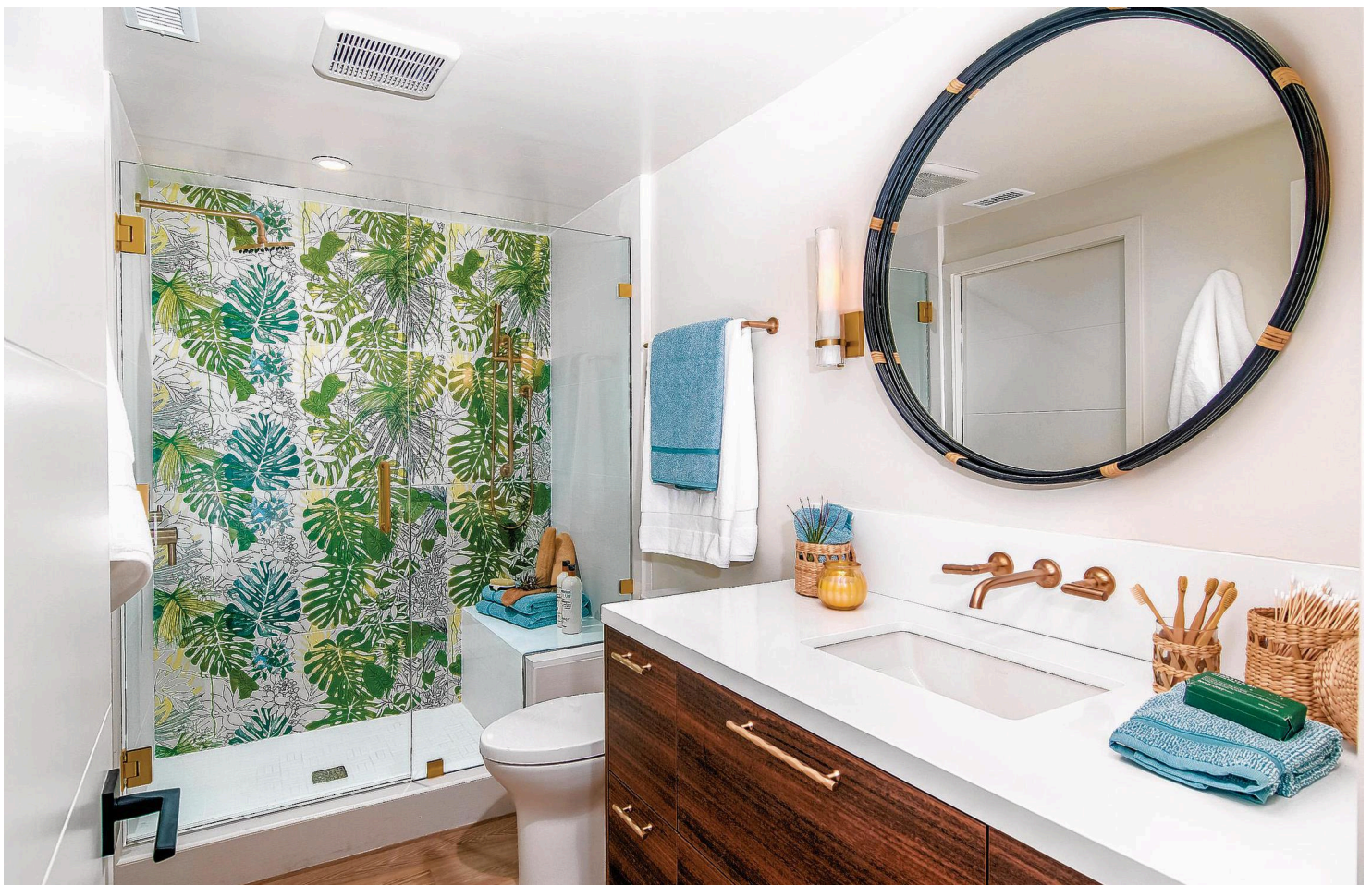
JACKSON DESIGN AND REMODELING