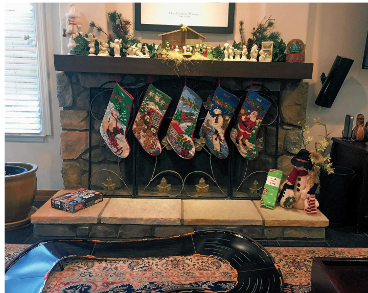
The original fireplace in the front of the home, featuring heavy stacked stone, was closed up in the remodeling process.

The kitchen’s focal point is its massive island, which seats four across and two on one end. There’s plenty of storage in the gray DeWils Fenix cabinets on the working side of the island, where the undermounted Kohler