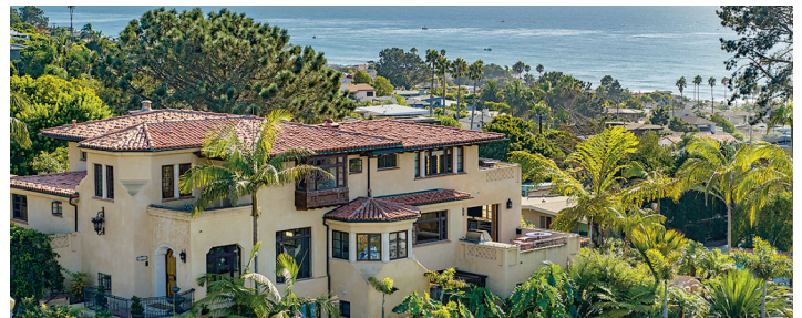
1135 BARCELONA DR | $3,550,000 5 BEDS | 5.5 BATHS | 5,782 SQ FT