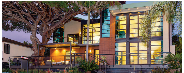
1035 DEVONSHIRE DR | $2,740,000 4 BEDS | 4 BATHS | 3,570 SQ FT