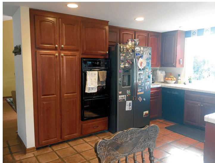
The original, smaller kitchen and dining room were separated by a wall and had contrasting flooring.

Lastly, there was the laundry room, off the entrance from the attached garage. It was a narrow space, wholly unworkable for a