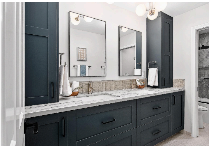
JACKSON DESIGN AND REMODELING (OUTDOOR ELEMENTS USA)

One of the original bathrooms was elongated to fit in a dual vanity with a separate toilet and enclosed shower/tub.