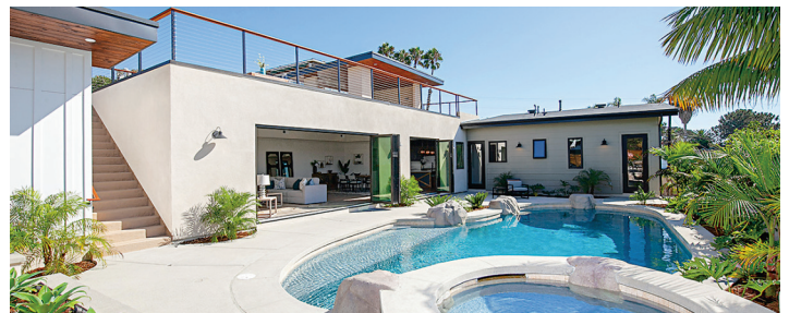
4382 PIEDMONT DR | $3,100,000 5 BEDS | 5.5 BATHS | 4,040 SQ FT

SAL CAN HELP SELL YOUR HOME FOR THE BEST PRICE TOO!