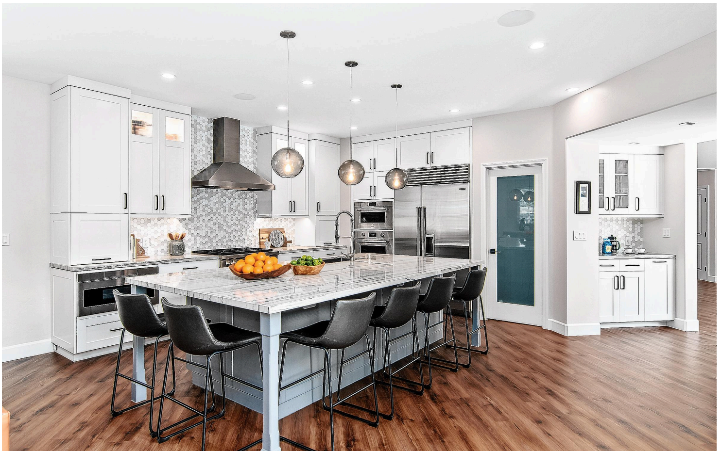
JACKSON DESIGN AND REMODELING (OUTDOOR ELEMENTS USA)

The large island, which seats six, serves as the focal point in the new kitchen. There is ample storage throughout the room, with cabinetry featuring durable Fenix laminate surfaces, which are resistant to fingerprints and abrasions.