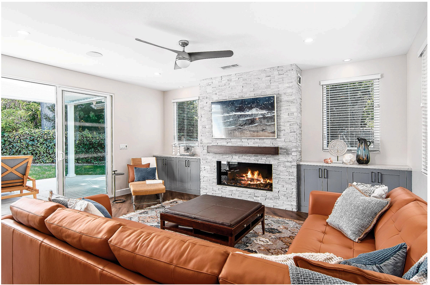
JACKSON DESIGN AND REMODELING (OUTDOOR ELEMENTS USA)

Like the kitchen, the family room features a great deal of natural light, including a sliding glass door that opens onto the patio and yard.