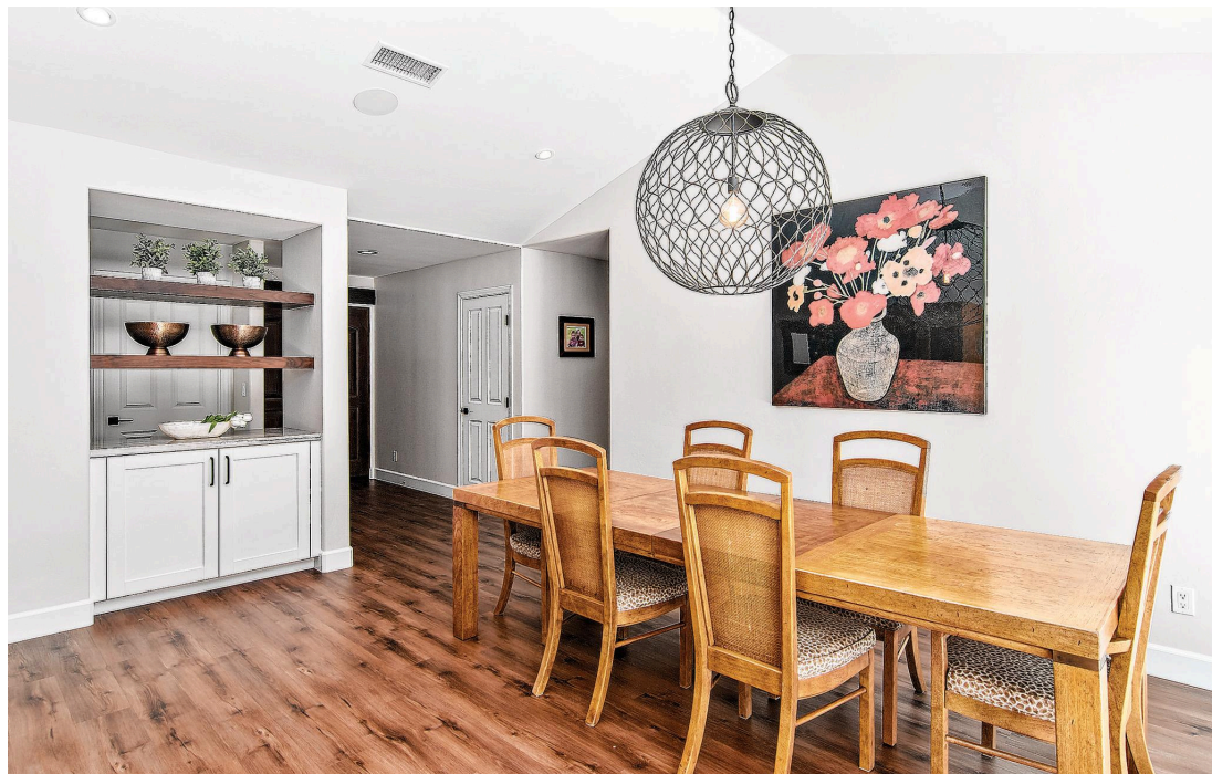
JACKSON DESIGN AND REMODELING (OUTDOOR ELEMENTS USA)

The same cabinetry and countertop in the kitchen were built in on either side of the fireplace. As for the furniture, the couple kept the lounge chair they already had but purchased a large, leather sectional and area rug from Arhaus in La Jolla. The family room, like the kitchen, is filled with light, thanks also to the wall of glass, including the slider that opens onto the patio