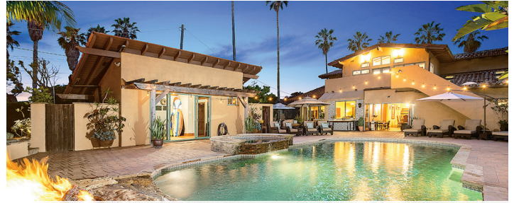
1145 SUNSET CLIFFS BLVD | $3,750,000 4 BEDS | 6 BATHS | 5,085 SQ FT + POOL HOUSE