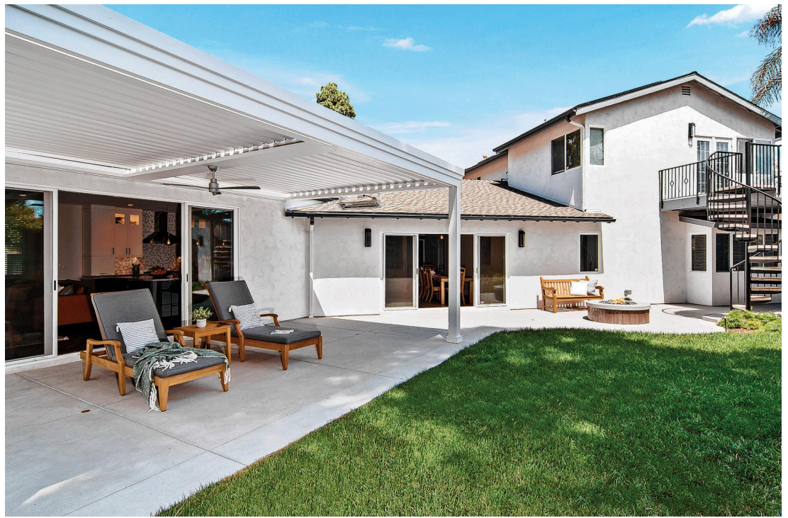
JACKSON DESIGN AND REMODELING (OUTDOOR ELEMENTS USA)

The second downstairs bathroom for the oldest son — and which the parents intend to use down the road — is the one that had that peculiar division between the open vanity and the rest of the bathroom. The wall that divided them was removed and a pocket door to the bathroom to create privacy was installed. Contreras designed a separate water closet next to the shower, which features two showerheads, white 4-inch-by-16-inch subway tiles on the walls, 12-inch-