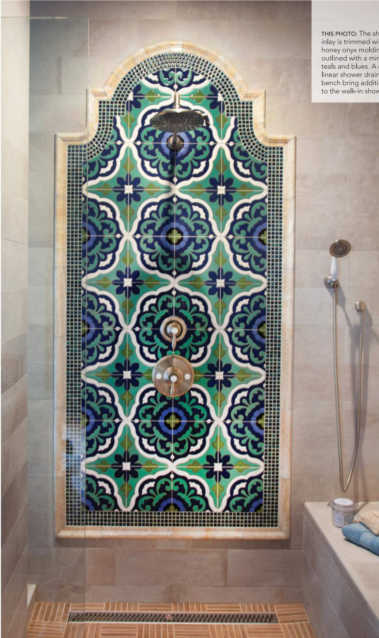
THIS PHOTO: The shower's tile inlay is trimmed with a golden honey onyx molding and outlined with a mini mosaic in teals and blues. A decorative linear shower drain and built-in bench bring additional luxury to the walk-in shower.